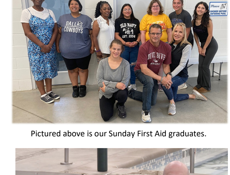
Pictured above is our Sunday First Aid graduates.