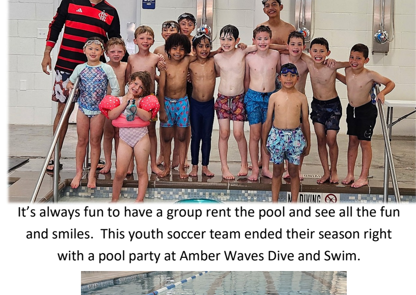
It's always fun to have a group rent the pool and see all the fun and smiles. This youth soccer team ended their season right with a pool party at Amber Waves Dive and Swim.