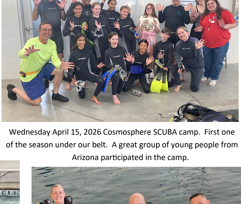
Wednesday April 15, 2026 Cosmosphere SCUBA camp. First one of the season under our belt. A great group of young people from Arizona participated in the camp.