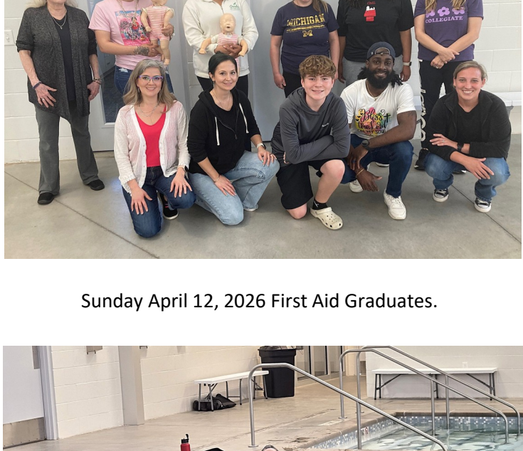
Sunday April 12, 2026 First Aid Graduates.