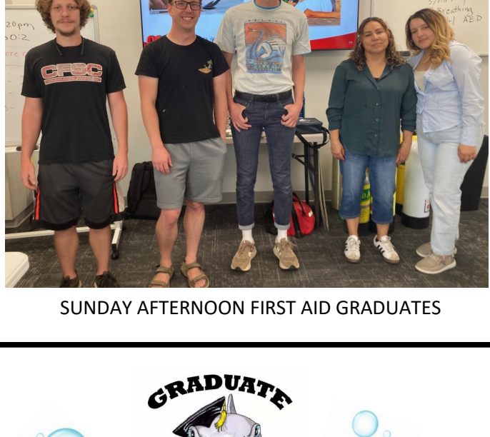
SUNDAY AFTERNOON FIRST AID GRADUATES