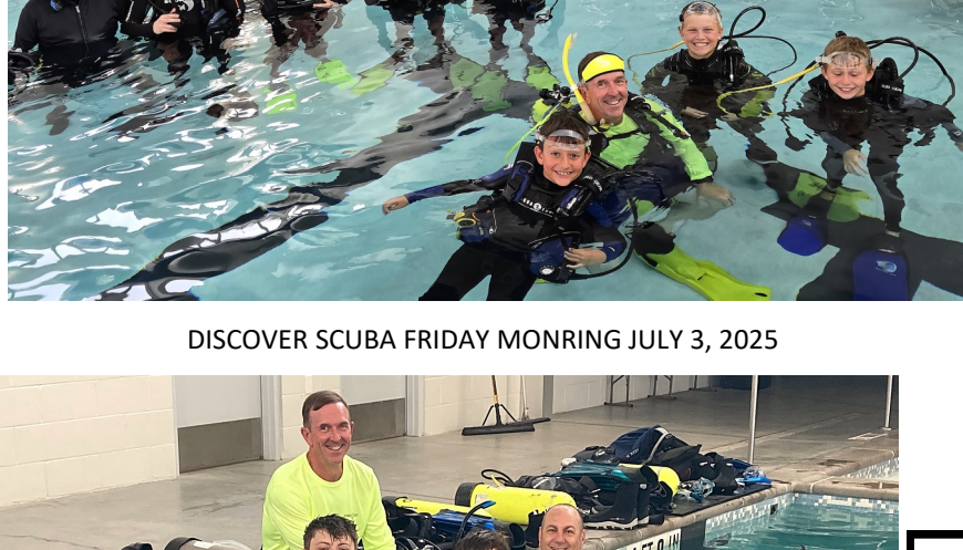
DISCOVER SCUBA FRIDAY MORNING JULY 3, 2025