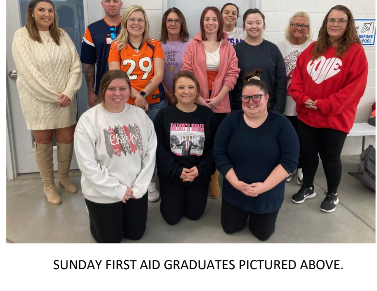
SUNDAY FIRST AID GRADUATES PICTURED ABOVE.