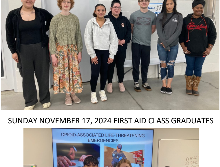
SUNDAY NOVEMBER 17, 2024 FIRST AID CLASS GRADUATES