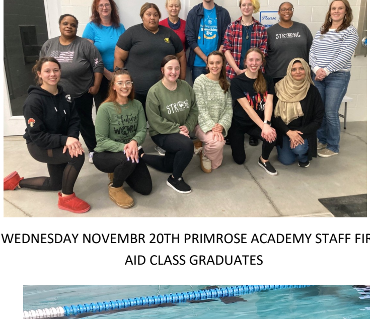
WEDNESDAY NOVEMBER 20TH PRIMROSE ACADEMY STAFF FIRST AID CLASS GRADUATES