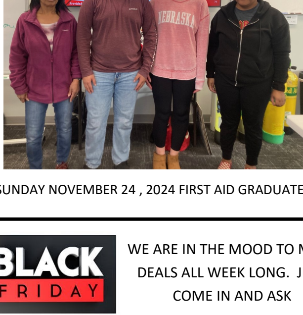
SUNDAY NOVEMBER 24, 2024 FIRST AID GRADUATES.