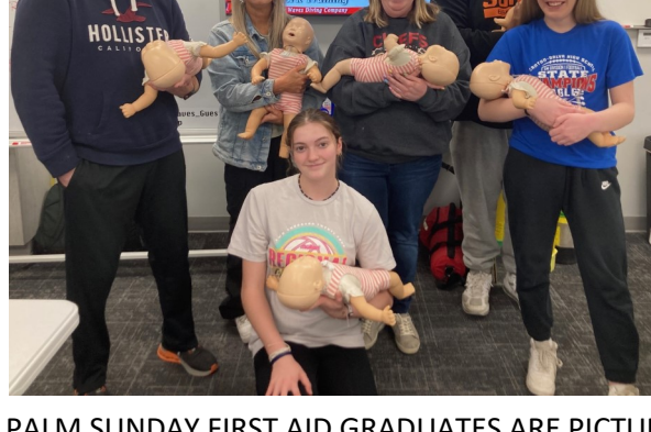
OUR PALM SUNDAY FIRST AID GRADUATES ARE PICTURED ABOVE. THEY WERE A LOT OF FUN TO TEACH.