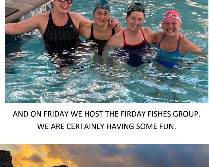
AND ON FRIDAY WE HOST THE FIRDAY FISHES GROUP. WE ARE CERTAINLY HAVING SOME FUN.