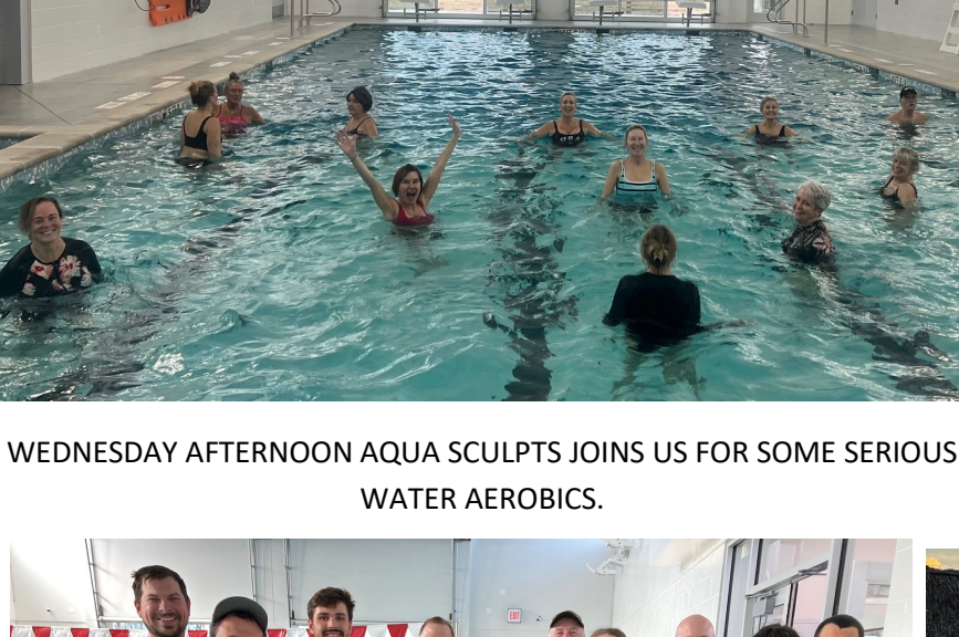
WEDNESDAY AFTERNOON AQUA SCULPTS JOINS US FOR SOME SERIOUS WATER AEROBICS.