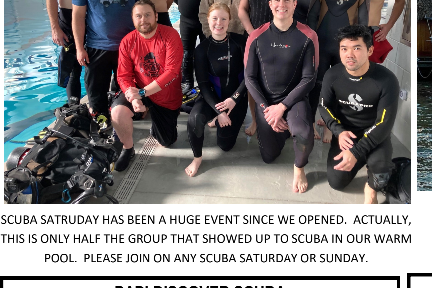
SCUBA SATURDAY HAS BEEN A HUGE EVENT SINCE WE OPENED. ACTUALLY, THIS IS ONLY HALF THE GROUP THAT SHOWED UP TO SCUBA IN OUR WARM POOL. PLEASE JOIN ON ANY SCUBA SATURDAY OR SUNDAY.