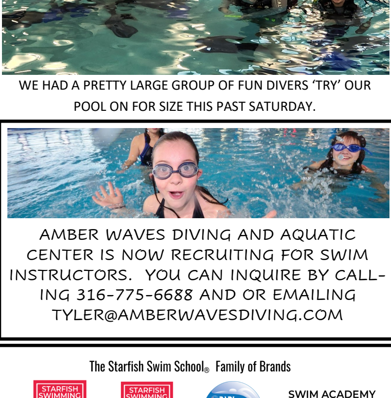
WE HAD A PRETTY LARGE GROUP OF FUN DIVERS 'TRY' OUR POOL ON FOR SIZE THIS PAST SATURDAY.

I feel so very blessed to have two business partners who "believe," therefore always have helping hearts. God Bless all of you and "Let it be."