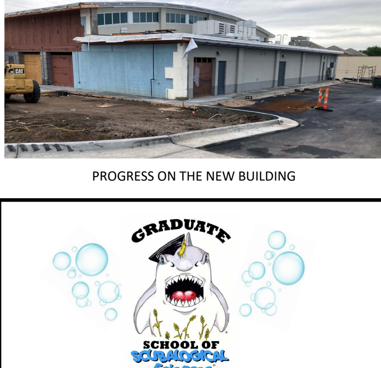
PROGRESS ON THE NEW BUILDING